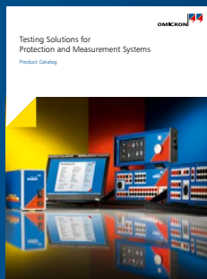
Product catalog (secondary equipment)

The following publications provide detailed information on the products described in this brochure and their applications: