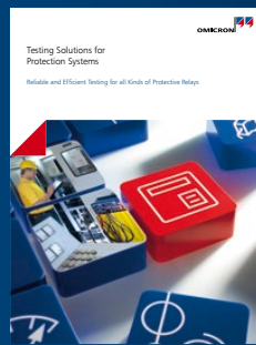
Testing Solutions for Protection Systems

For more information, additional literature, and detailed contact information of our worldwide offices please visit our website.