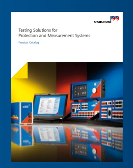
Product catalog (secondary equipment)

The following publications provide detailed information on the products described in this brochure and their applications: