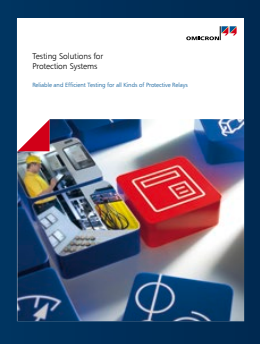
Testing Solutions for Protection Systems